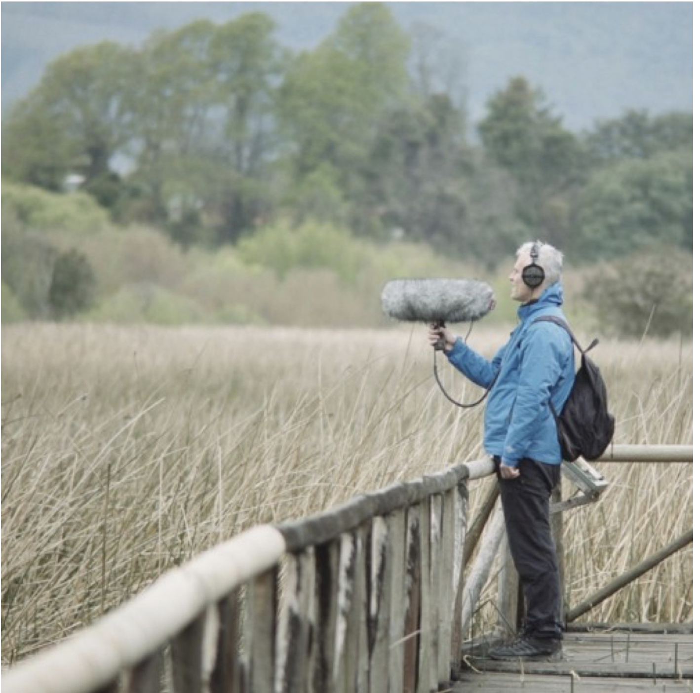
Marco Barotti - Clams (2019) https://www.marcobarotti.com/Clams